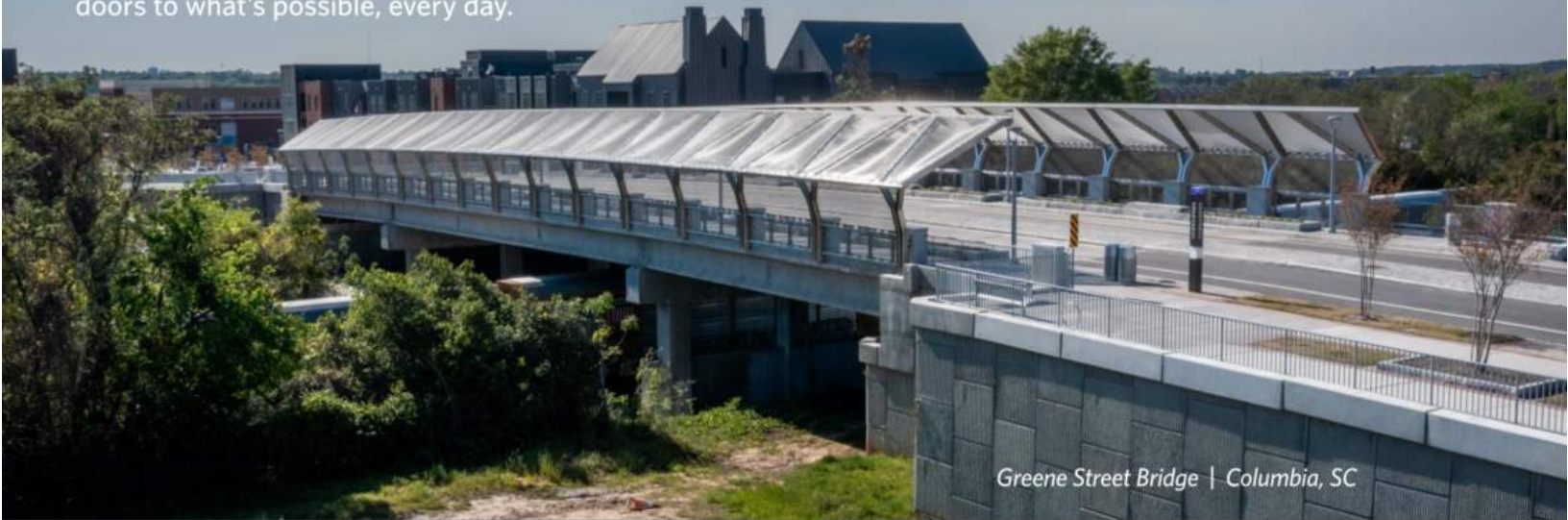
Greene Street Bridge | Columbia, SC

At HDR, we're helping our clients push open the doors to what's possible, every day.